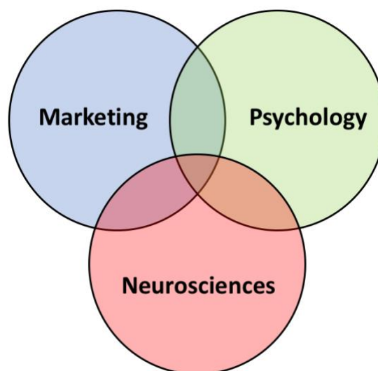
Figure 1: Basic areas in neuromarketing

application of neuromarketing in the early days was the taste test between Coke and Pepsi in an unpublished experiment by Read Montague (McClure et al., 2004). In the challenge, the respondents were asked to blindly taste both Coke and Pepsi. fMRI was used to scan the brain of respondents to see if they like Coke over Pepsi. Before the test started, the participants said they favored Coke over Pepsi, but preferred Pepsi over Coke during the blind test taste. McClure et al. (2004) noticed that Coke's marketing strategy was much more advanced than Pepsi and unavoidably led the customer to believe that Coke is much favored. The outcome of this study shows that consumers often convey something else, even though they have another choice subconsciously (Babu & Vidyasagar, 2012). The theory of neuroscience can therefore be used in marketing research to explore the response of consumers to stimuli effectively.